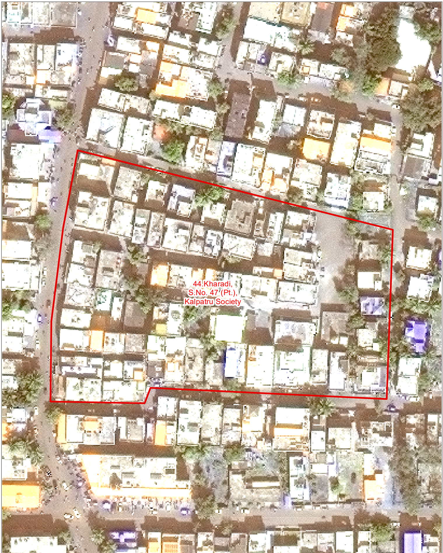
Micro Containment Zone Area - 44.Kharadi, S.No. 47 (Pt.), Kalpatru Society